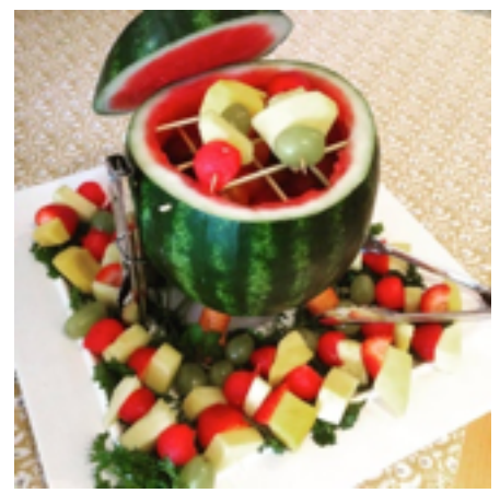
(Above) Weber-Style BBQ with fruit kebobs on the grill

(Pictured left) Watermelon boat to hold the fruit salad complete with Lego toy, umbrella and masts made from the watermelon rind.