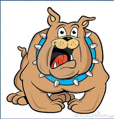
Our mascot The Churchill Bulldog