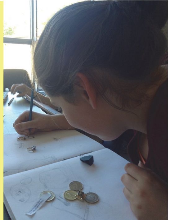
City View parents get in on the fun, sharing their interests with the school

Come out and lead a workshop! Share your hobby/interest or try something new. We've had parents do yoga, activist button-making, sewing, cartooning and cinnamon bun baking workshops, to name but a few.