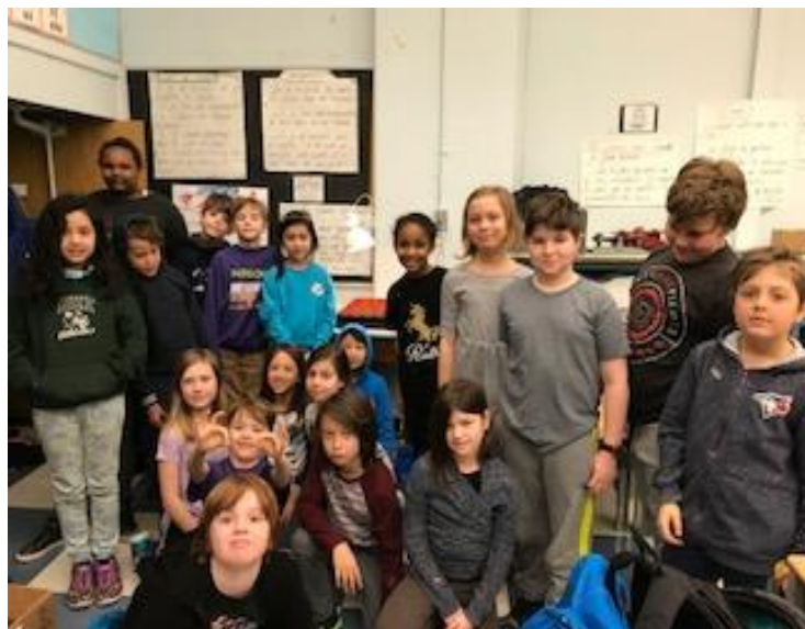
Mme Hilaire's class got a visit from the Toronto Region Conservation Authority's Outreach program and are growing some aquatic plants that will be transplanted later this spring to help the watershed!