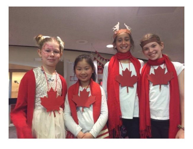
Duke at the Regional Heritage Fair