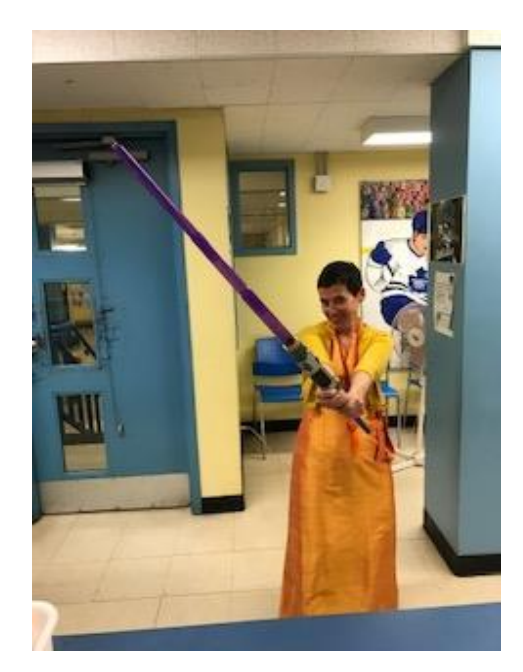
Star Wars Day