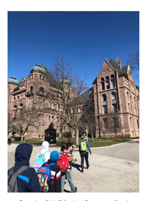
Grade 5/6 Trip to Queens Park