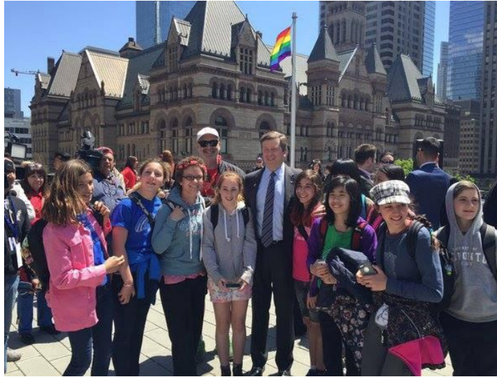
Toronto Mayor John Tory greets Earl Beatty Rainbow Alliance on May 17 th .