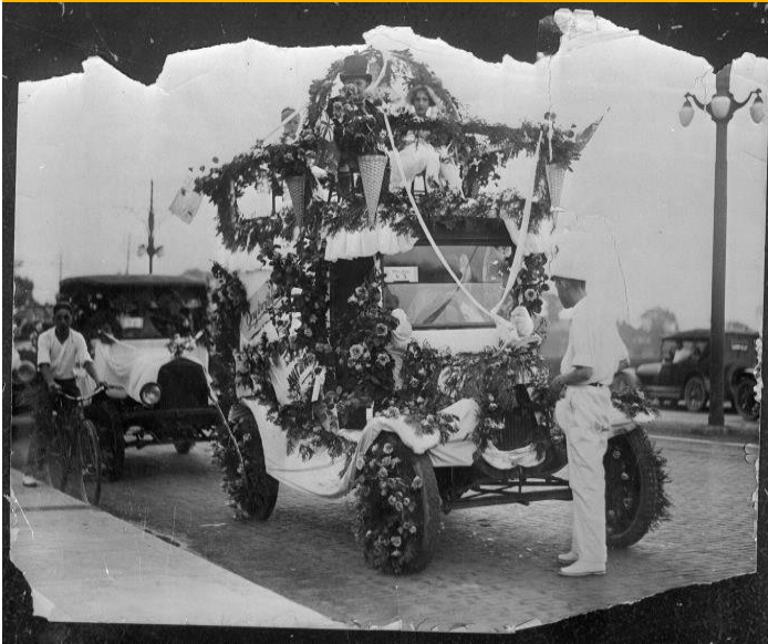
Source: Danforth Business Association Annual Spring Parade, 1925, showing Percy Waters florist display. Percy Waters is still on the Danforth west of Monarch Park Avenue. They have been selling flowers in the neighbourhood since 1911.