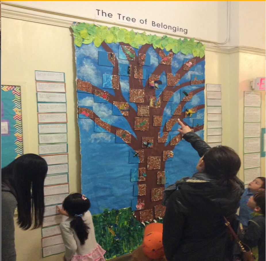
Parents, family members and students admire the Tree of Belonging, one of the amazing productions on display at Earl Beatty's Arts Night.

Grade 5/6 - "If I provide more opportunities for students to get to know and trust each other better through cooperative games, then students will feel a greater sense of belonging in the class."