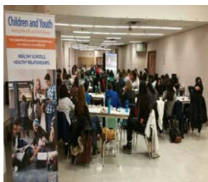
Students as Champions of Mental Health and Well-Being Forum