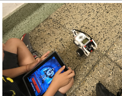
Solving a problem using coding and an EV3. #Robotics #21 st Century Skills