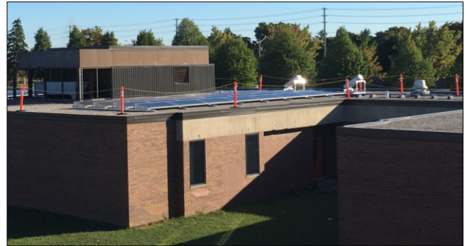
Hollycrest Middle School is one of 26 Etobicoke Centre schools to receive solar panels.

As you no doubt have heard, there has been a huge problem with school bussing. New drivers are filling the routes every day and the situation is much improved. For more details, see the story on page 4.