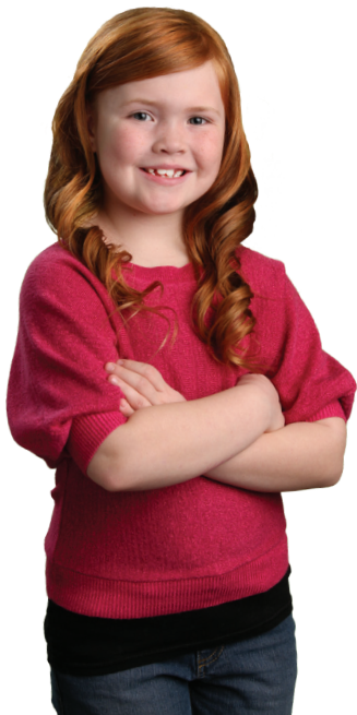
Photo proofs will be sent home with your child approximately two weeks after photo day to place an order. Please note, a class group photo may also be taken on photo day.

School and Sports Photography | A Truly Canadian Company | memories made easy