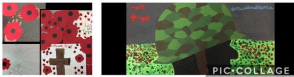
Images from our Remembrance Day video tribute. All artwork created by our Milne Valley students.