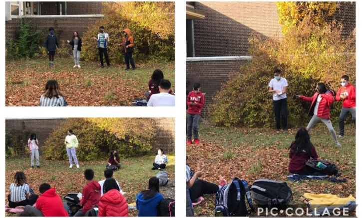
All our classes have been making use of our outdoor classroom spaces to inspire their presentations, artwork, music and writing.