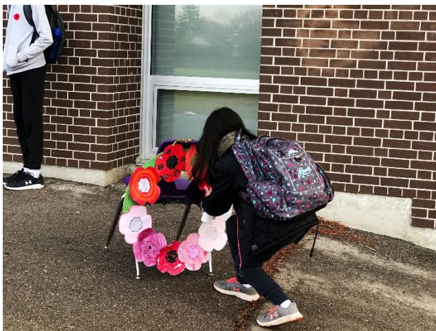
During our outdoor ceremony, students from each class added a poppy to our remembrance wreaths.