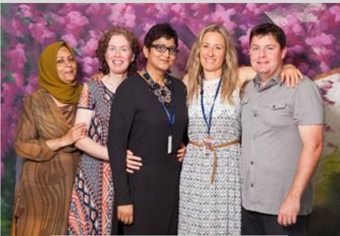
Room 5 Team