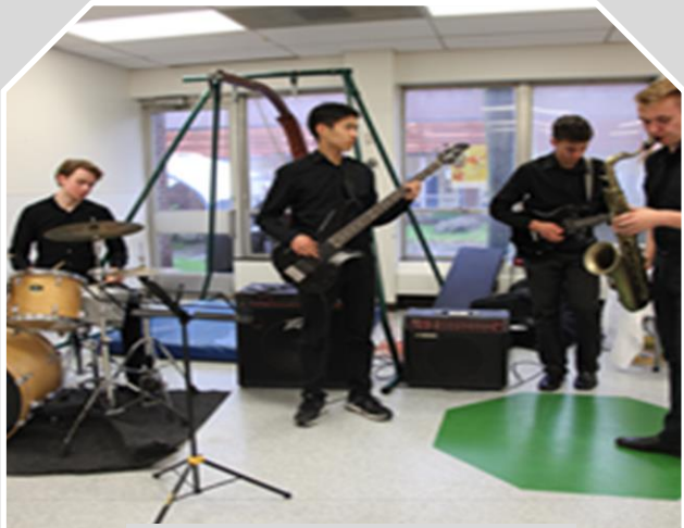
Don Mills CI Jazz