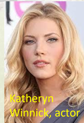
Katheryn Winnick, actor