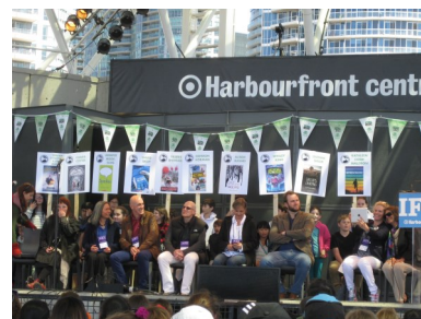
Our students and teachers getting cozy with authors at the Festival of Trees Trip at Harbourfront