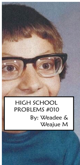
HIGH SCHOOL PROBLEMS #010 By: Weadee & Weajue M

Happy Birthday (or belated birthday) you charming, diplomatic, artistic children of the zodiac! What a way to start your new yearly astrological cycle with so much planetary energy in your birth sign. You are truly on center stage as you have a lot to say and a lot to do. Good luck!