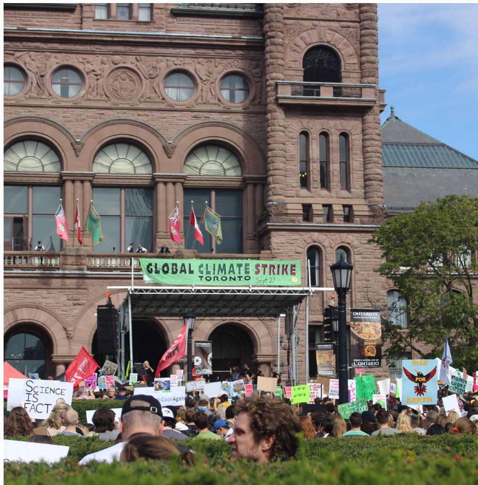
Protesters briefly paused their march outside of The Ontario Legislative Building

What is climate change, and why is the world talking about it at the moment? In the simplest terms, climate change means the Earth is getting hotter - the planet is "on fire". CO2 emissions are alarmingly increasing global warming, which plays a big factor in climate change. Even though there has solely been an increment of 1-degree Celcius since 1880, this change has significantly affected the Earth. Oceans are 40% more acidic than before. Weather is becoming more extreme: heatwaves and damaging wildfires are frequent, hurricanes and tsunamis are stronger. Droughts and water shortages are prevalent in certain regions in the Middle East, Asia, and Africa. Some people may say climate change was crystal clear from 30 years ago, but meaningful measures were not taken to back this up - the United Nations (UN) did not consider it a threat, nor did it try to convince all 197 countries within the UN to come up with an agreement to help fight climate change. However, "People are suffering, people are dying, entire ecosystems are collapsing. We are in the beginning of a mass