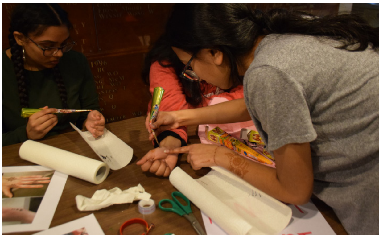
Getting henna done