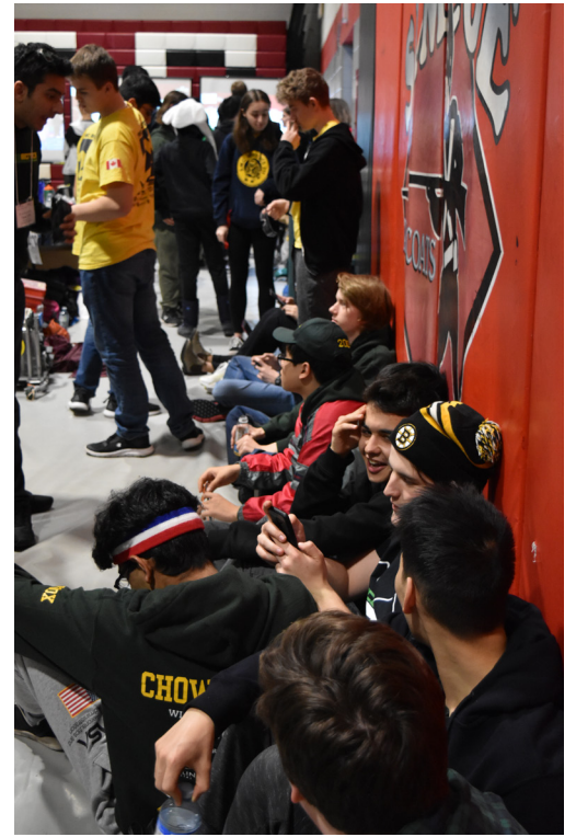
Members on standby