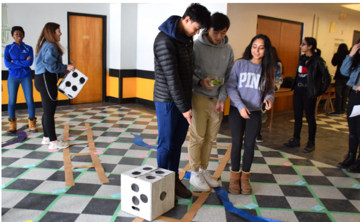
Playing life-size Snakes and Ladders - Photo by Sameen Yousuf