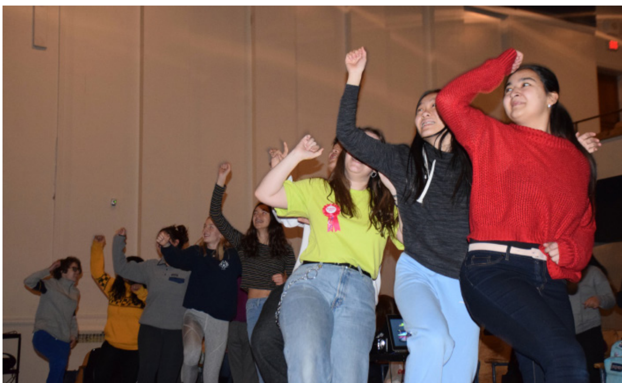
Singing and dancing on Karaoke Day - Photo by Sameen Yousuf