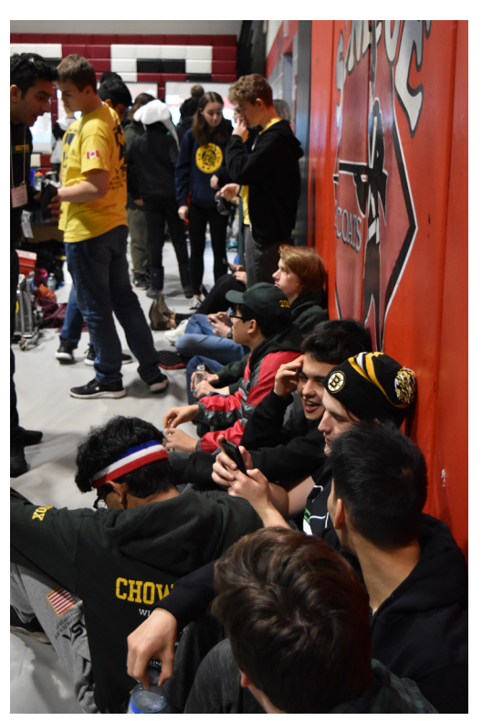
Members on standby

had finally paid off. We'll be watching you in Kentucky from However, with all Lancebotics the VEX stream broadcasts. 200X!