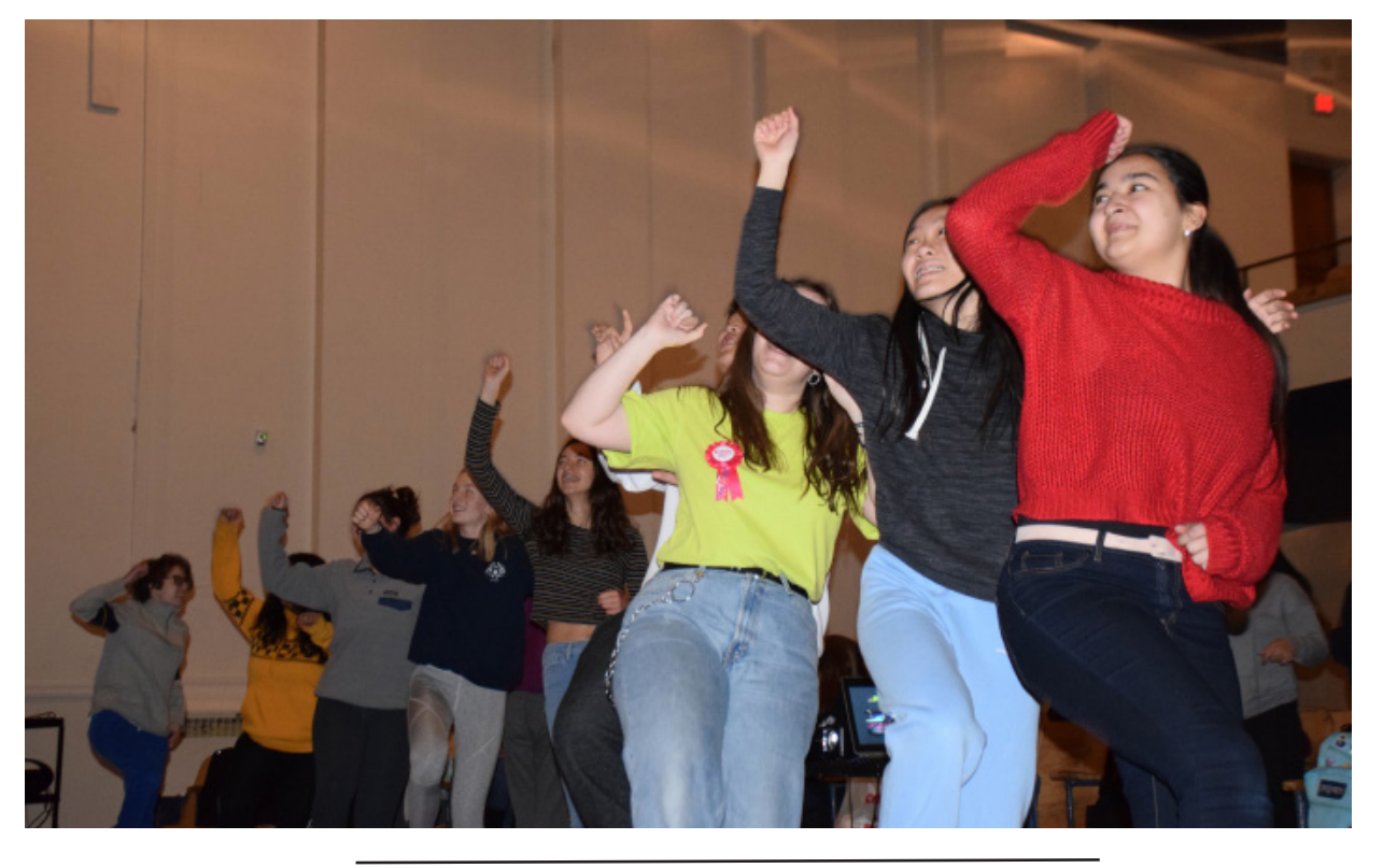
Singing and dancing on Karaoke Day