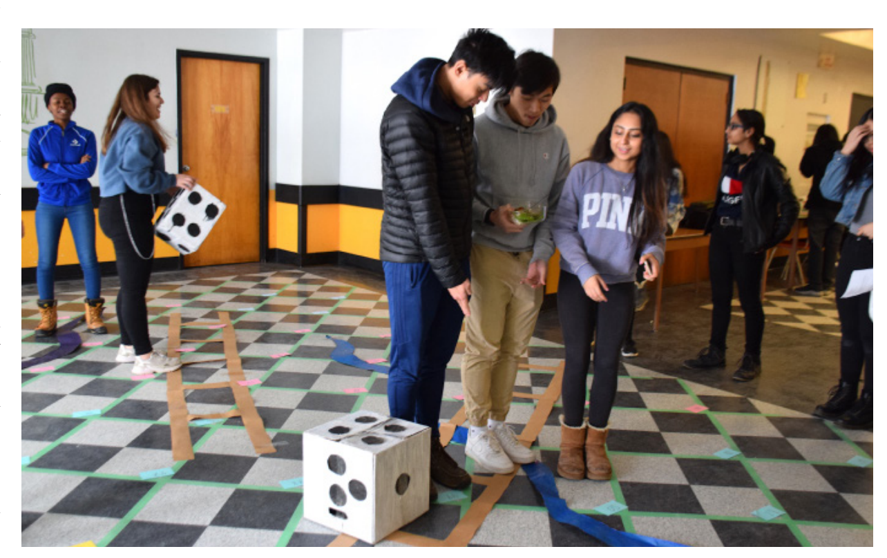
Playing life-size Snakes and Ladders