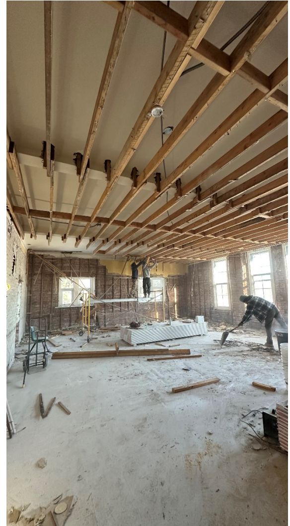
First Floor Kindergarten Classroom 2