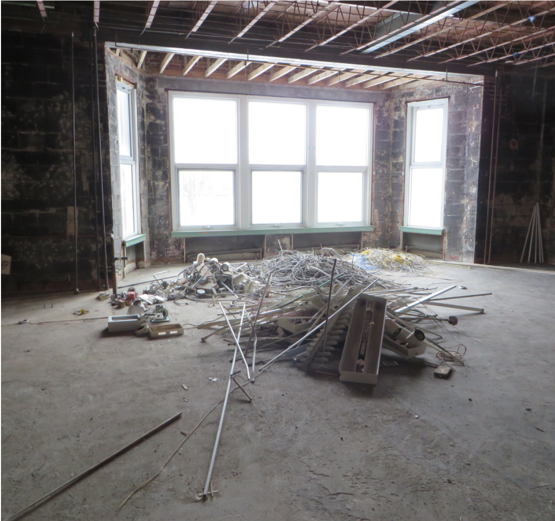
First Floor Kindergarten Classroom 1