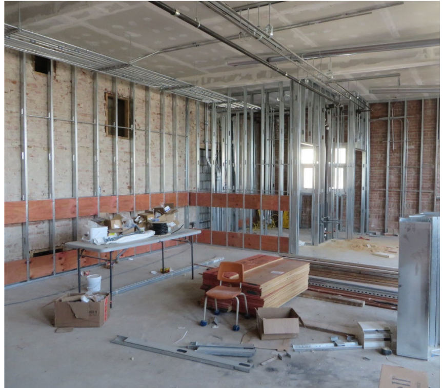
First Floor Partition Work In Progress