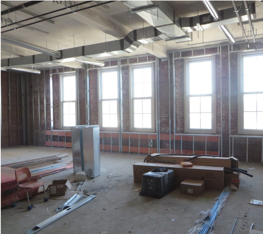
First Floor Mechanical/ Electrical Work In Progress