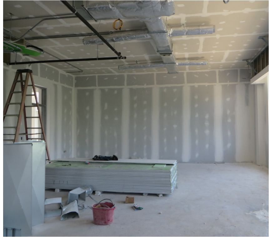
Interior Work In Progress