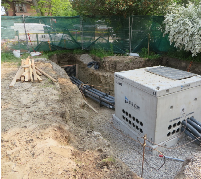
New Hydro Service In Progress