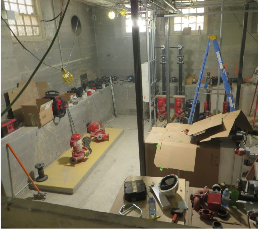
Mechanical and Electrical work In Progress