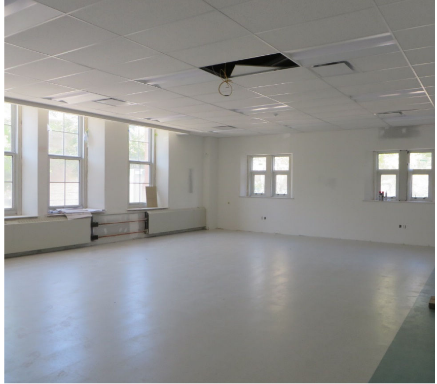
Interior Work In Progress