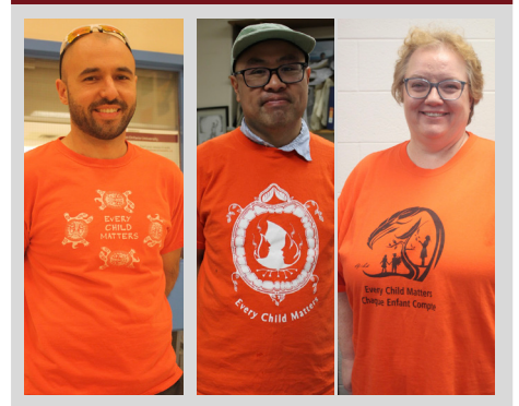
ACCI HOODY SALES