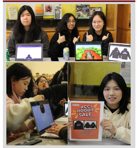
ACCI HOODY SALES