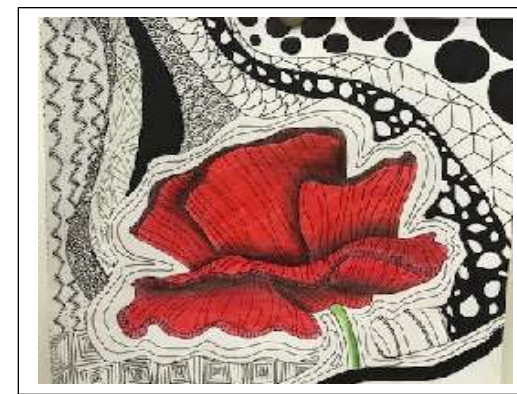
JP, Grade 7