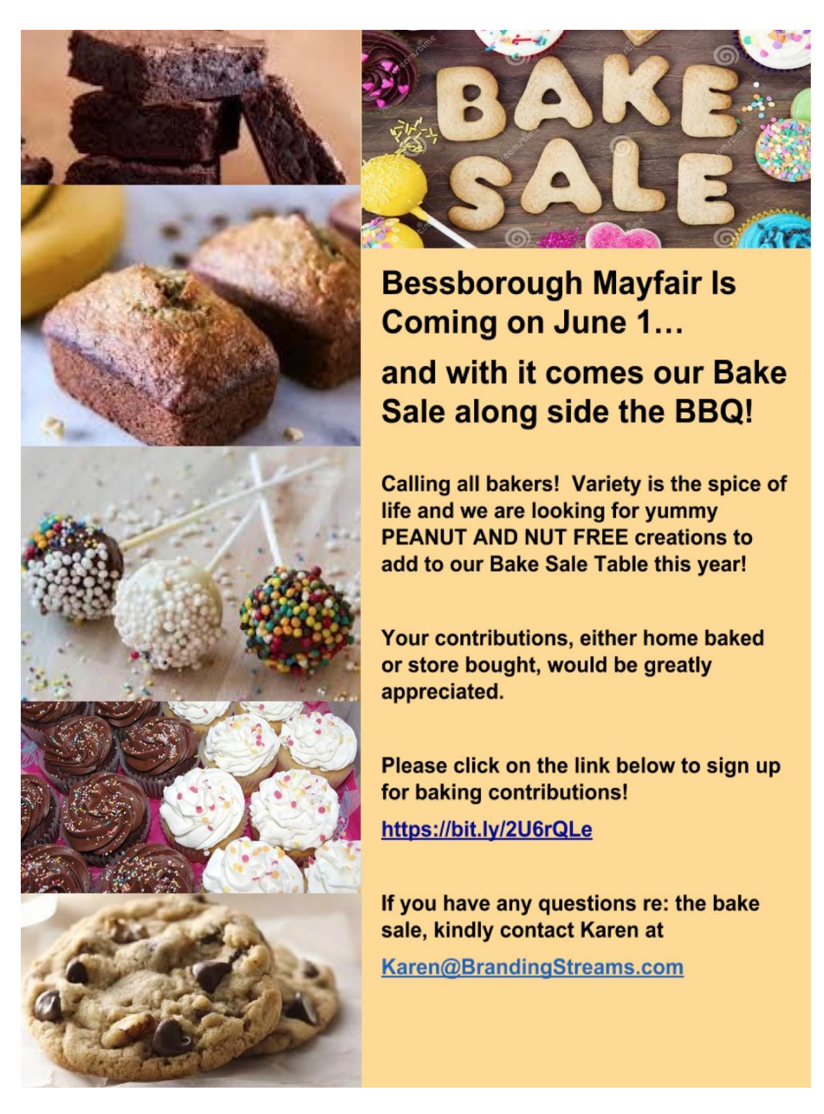
Baking Contribution sign up link