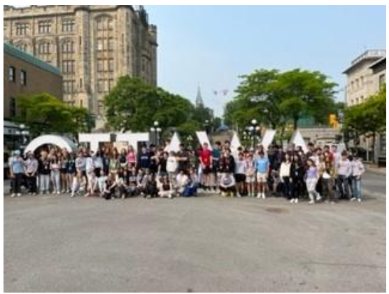
Parliament Buildings and group picture with the Ottawa sign in Byward Market