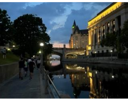
Ottawa Ghost Tour