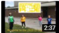
Birchmount Covid Guidelines The Birchmount Park Peer Leaders explain the new safety protocols for...