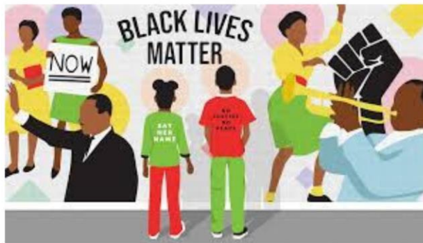
Illustration by Emma Darvick