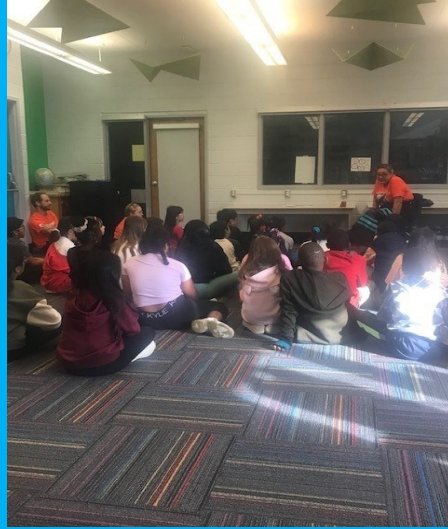
Students engaging in ongoing conversations about the significance of Truth & Reconciliation and Orange Shirt Day.