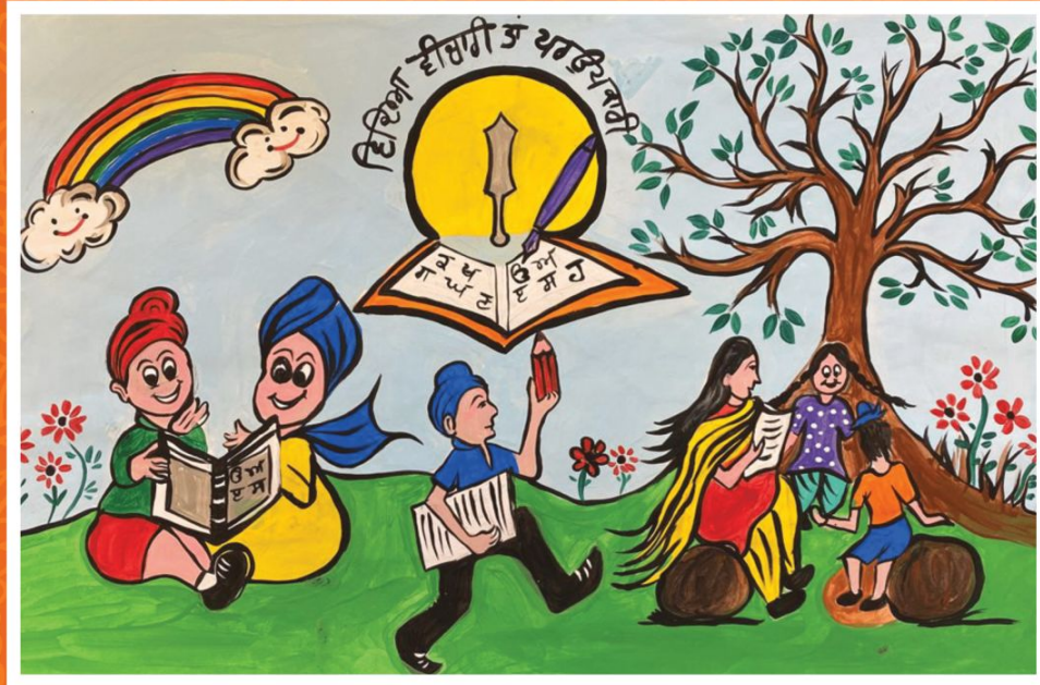
Yuvraj, Gracedale P.S., Grade 3

Come to learn, go to serve; the goal of education is to serve humanity.