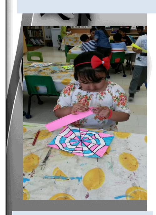
Sprihaa is putting the finishing touches on her Op Art. The grade 3 students learned how to create art with optical illusions.