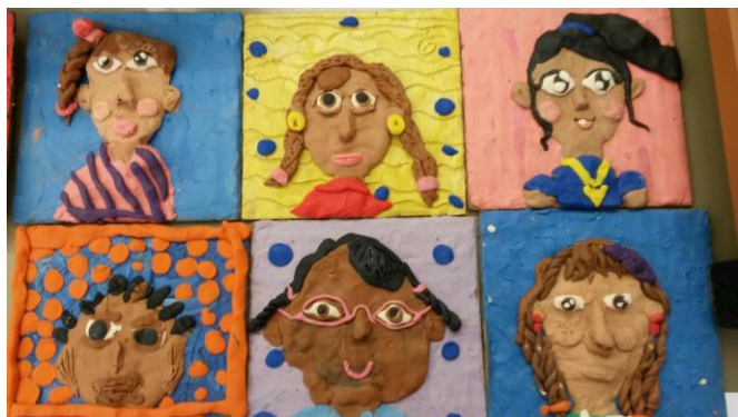
Family Math @ C.T.