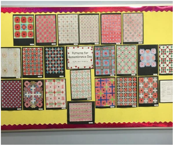
Remembrance Day Art, Ms. Allan’s class, Gr. 6

For students who eat in the lunch room, if parents could please reinforce the necessity to follow the expectations of the Lunch Room Supervisors. Sit at assigned seats, use inside voices, ask for permission to leave the room and clean your area after eating. The goal is to have students enjoy their lunch and then have time for outdoor play.