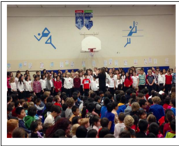
Denlow’s Junior Choir