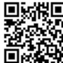
Fashion Show Sign-Up