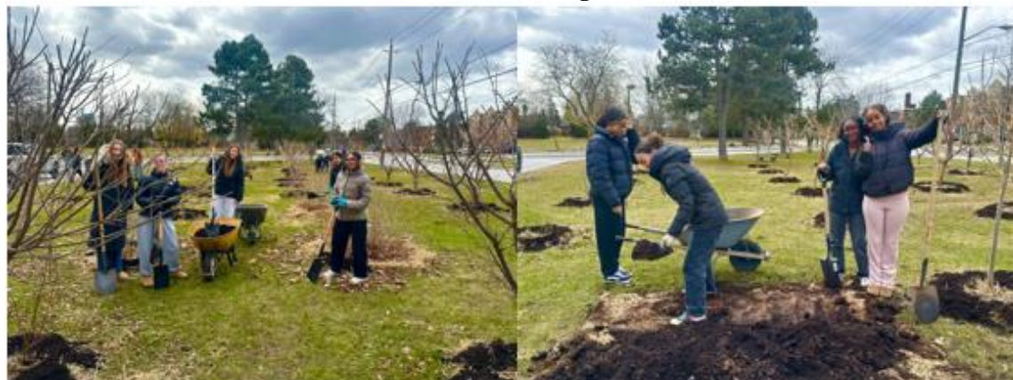
Green Industries Soil Conditioning for our Varied Trees