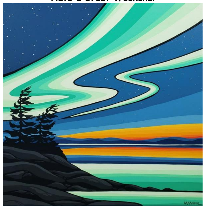
Have a Great Weekend!