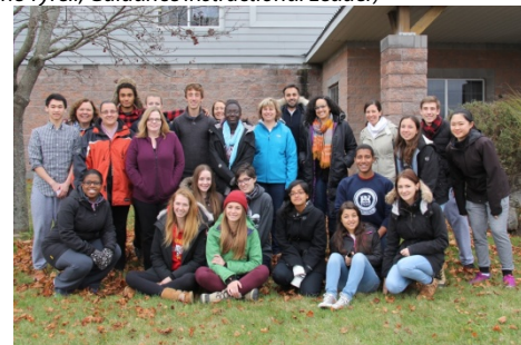
Staff and students of the Youth Mental Health and Addictions Champions Project at the Teen Ranch