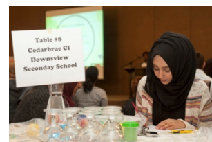
Students at the First Annual Mental Health and Well-Being Secondary School Student Symposium