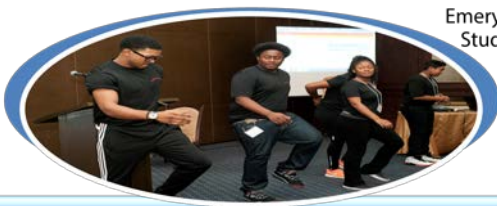
Emery CI and Thistletown CI Students lead the Physical Activity Break