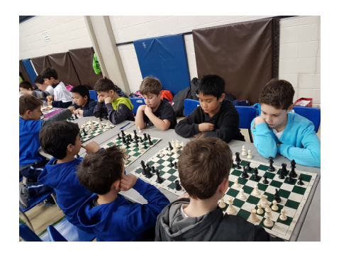
Faywood ABC @ the TDSB North Chess Tournament

Faywood will run a 1-week clothing drive between April 18 to 21. Our school community is encouraged to donate unwanted clothing and textiles. Diabetes Canada is providing a free corrugated box, to be placed in front of the main foyer by the DayCare entrance. Diabetes Canada will pick up the box and donations at the end of the clothing drive from the schools beginning April 24th.