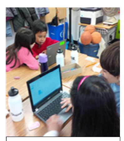
Grade 3 and 4 students using Google Draw to help them pose and solve problems in math class.