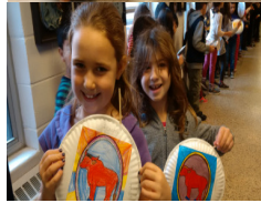
Lunar New Year Celebration