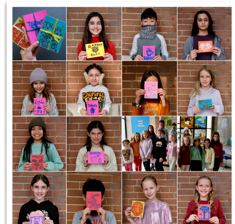
Photo Above: Kids Card Club kids proudly showing off their designs from last session

Sign up for this term's Kids Card Club for Grades 4-6 students! The club begins Tuesday, January 23rd, 2024 at lunchtime (11:30 am - 12:35 pm). Students bring their lunch and eat with the club, then they will create linoleum prints and stamp on cards. Kids Card Club is free and instructed by artist Amy Bond. Returning Card Club members must sign up again, and the group welcomes new students. Please sign up here and visit the Kids Card Club Website for more information.