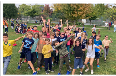
Photo above: Frankland students after completing the Terry Fox Run