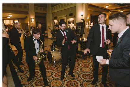
Photo above: The Sidewalk Crusaders grooving to an exciting musical performance

This year's Frankland's Boo Bash Fall Fundraiser is hosting The Sidewalk Crusaders who will perform in the school's very own yard!