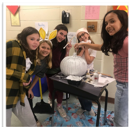
Photo above: Frankland students from Rm. 204 painting what will be the Boo Bunny

This week Frankland teachers gave Falcons the opportunity to get creative and decorate a class pumpkin for Frankland's annual Pumpkin Raffle! The class pumpkins will be on display at 3:20pm on Friday, October 28th, 2022 in the school's foyer and again at the Boo Bash on Saturday, October 29th, 2022 in the school yard. Parents who buy tickets for the raffle can enter to win a class pumpkin and use it for their home porch display on Halloween. Some notable pumpkins from previous years include Spiderman, Shrek, Solar System and Emoji pumpkins! Tickets are $2 each or 3 for $5 (Cash only). All ticket sales will go towards 2023 school initiatives.