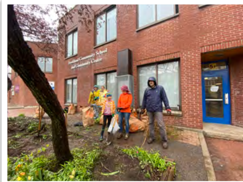
Photo above: Gardening Club meets on Tuesdays and Wednesdays, even in the rain! Thank you volunteers!

Frankland's Gardening Club has been diligently meeting and putting green thumbs to work by cleaning up the gardens in front of the school to prepare for the planting of new pollinator habitats! After receiving the Pollinate TO grant for 2023, Frankland Falcon families are excited to contribute their energy and create a desirable green space for the community. Thank you to the volunteers who are making a difference with each shovel and dig!