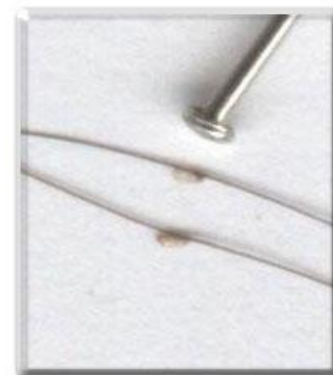
Attached nits enlarged