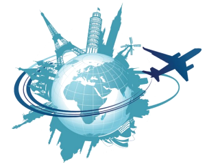
Hospitality and Tourism SHSM