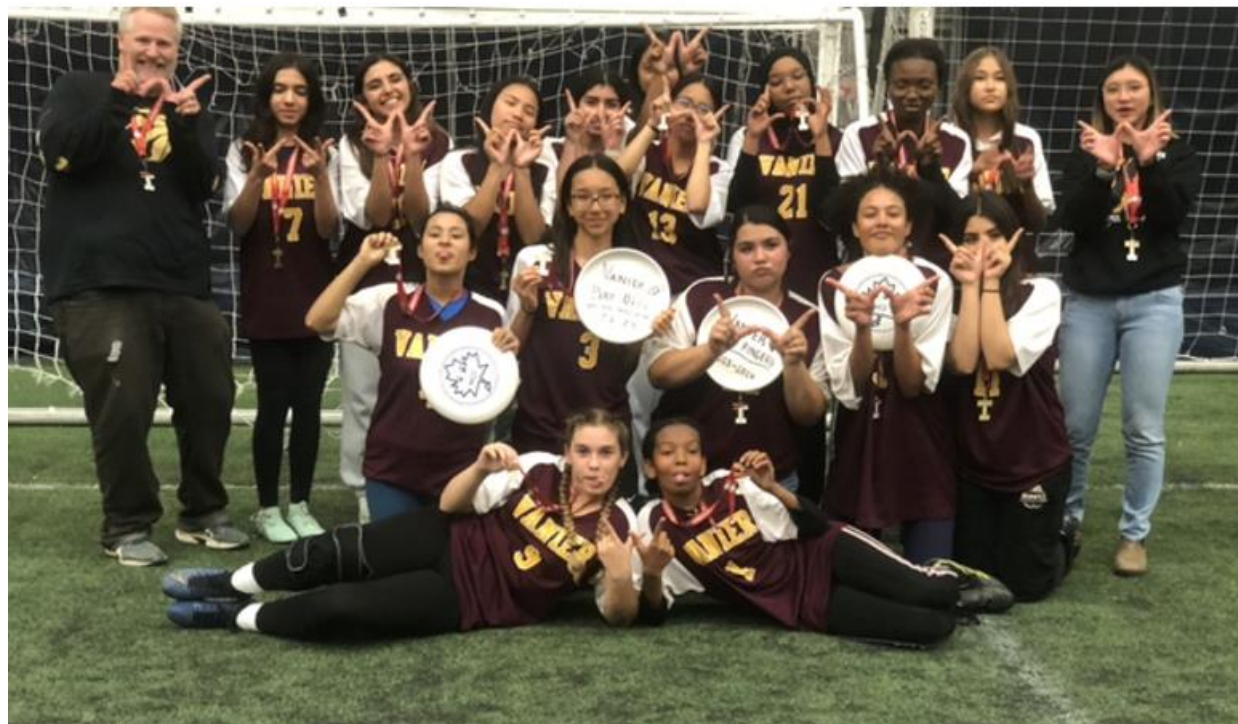
The Champs...Our Girls' Ultimate Frisbee Team