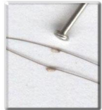
Attached nits enlarged