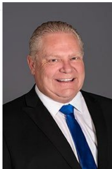
Doug Ford Premier

Best wishes for a meaningful anniversary and for many more years of success.