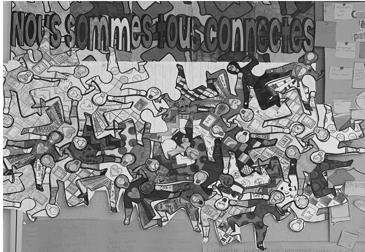
Grade 7 and 8 students create art to show the connectedness of their learning journey.