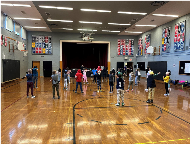
X-Movement getting active with our students.